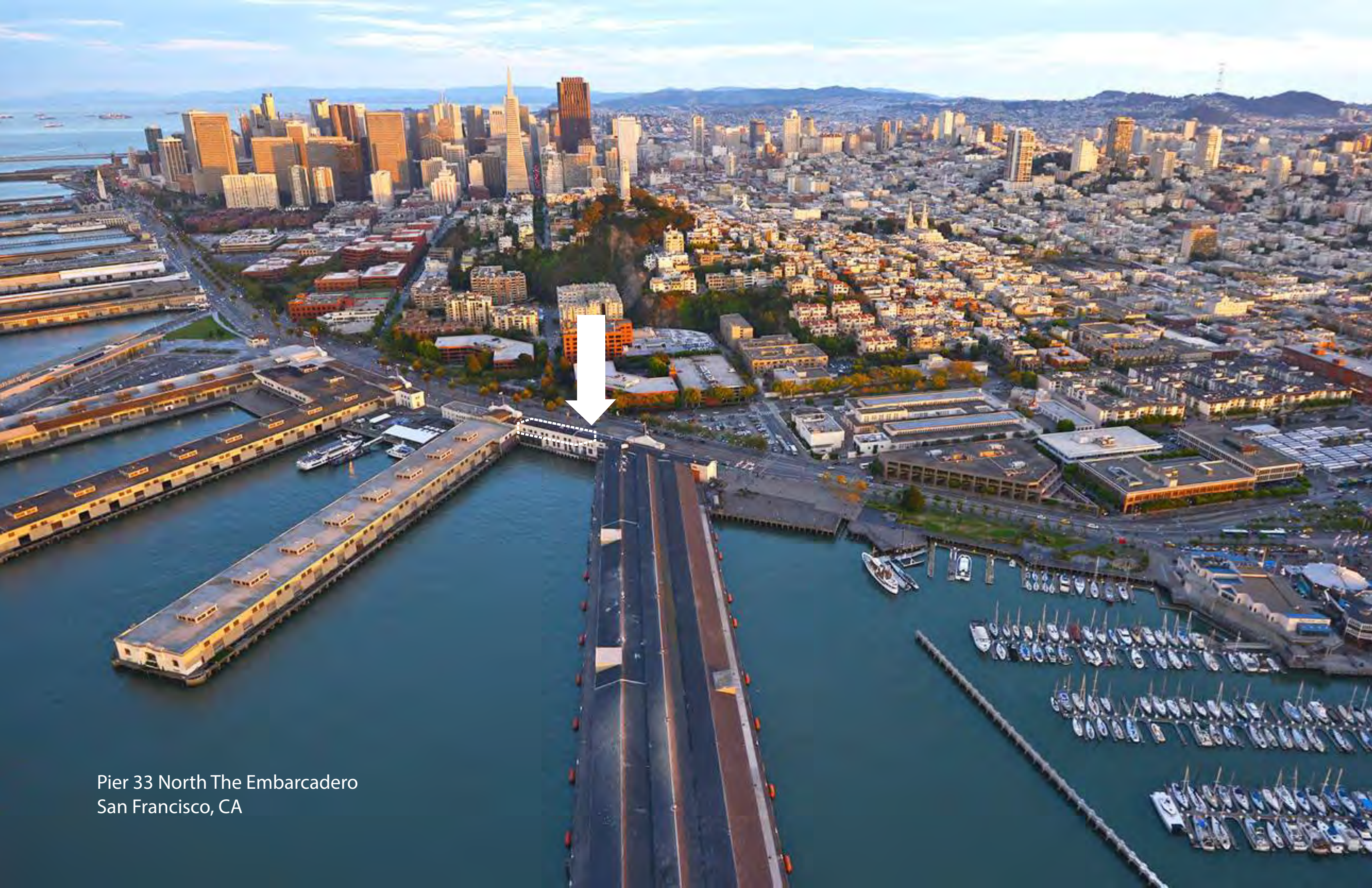
Pier 33 North The Embarcadero San Francisco, CA