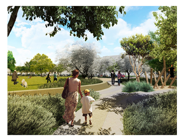
Esprit Park, Proposed

At 1.8 acres, Esprit Park is, by far, the largest greenspace in Dogpatch and the only facility managed by the Recreation and Parks Department. But the much-loved park is struggling to withstand current usage levels and is ill prepared for the thousands of new residents relocating to Dogpatch. An updated concept plan for the park was developed by Fletcher Studio as part of the Planning Department's Public Realm Plan. The park was confirmed as a priority at the community task force convened by UCSF. UCSF's resulting pledge of $5 million toward the renovation has accelerated the project. The GBD is helping to realizing the community's vision for the park by: