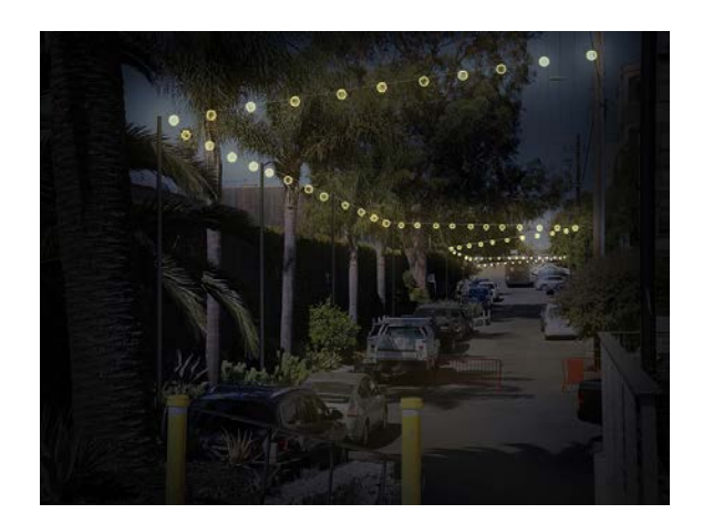
Angel Alley, Existing (left) & Concept Lighting (right)

The original improvements to Angel Alley – the rock retaining walls, succulent plantings, the Black-eyed Susan and trumpet vines along the fence – were installed by neighbors in self-defense, to mitigate the neglect and ugliness of the half-wide street and create a safer, happier place. Those improvements, plus the exploding growth north and south of Angel Alley, which now connects the Minnesota Street Project studios and galleries and the new apartments in south Dogpatch to the neighborhood's 22<sup>nd</sup> St. commercial corridor and the American Industrial Center and Mission Bay to the east and north, has made Angel Alley a prime north/south pedestrian and bike route in Dogpatch.