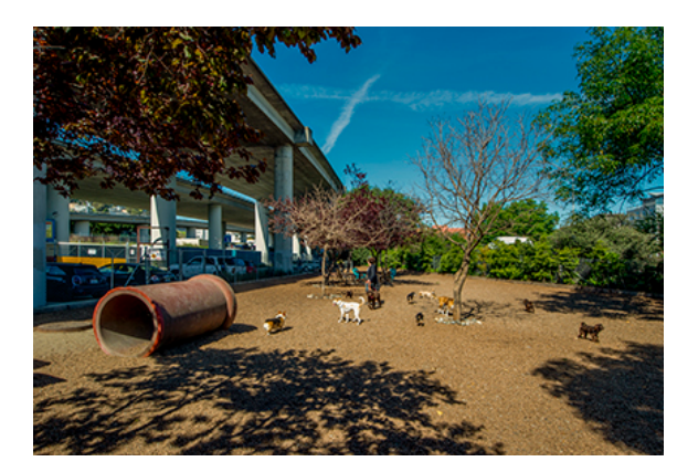
Current dog run and potential nursery site looking south, and north

The GBD was approached by the San Francisco chapter of the California Native Plant Society about possibly partnering on a native plant nursery for the purpose of propagating and distributing San Francisco native plants, especially native live oaks. The GBD has also discussed the possibility of providing a temporary staging area for Public Works trees and plants. The local CA Native Plant Society president and the founder of the Mission Blue Nursery suggested relocating the GBD's current Progress Park dog run and using that space for natives propagation. If the GBD is successful in obtaining a long term lease on the Gears parcel, and if neighbors deem it appropriate to relocate the dog run to that parcel - which is much larger, located closer to neighborhood center, and less encumbered by traffic and industry – then the existing dog run would be a perfect size and exposure for the nursery, which would