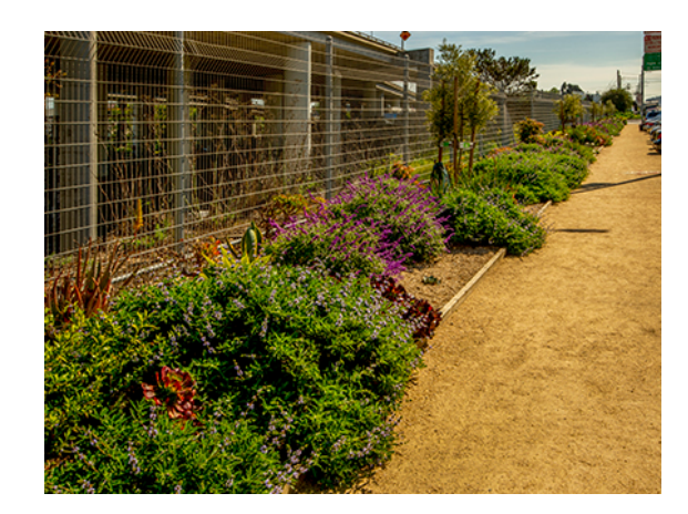
Iowa St Greening, Proposed; Pennsylvania Ave Greening, nearby

There is a small strip of land adjacent to SFMTA's Wood Yard bus facility and opposite the 22<sup>nd</sup> St Caltrain Station, which the GBD upgraded in 2019. On the opposite side of the Caltrain line is the Pennsylvania Avenue gardens that the GBD created in 2016. The Gears parcel is the next block south of this stretch of Iowa. The planting would