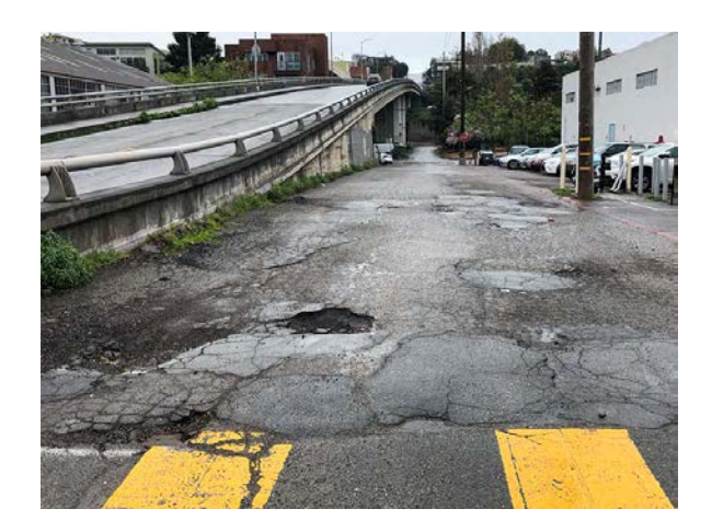
20<sup>th</sup> Street's crosswalks to nowhere

Dogpatch's infrastructure is fractured and incomplete, especially when it comes to pedestrian paths of travel. Advocating for pedestrian planning has become a key function of the GBD. Some of the most challenging conditions exist as a result of the large overpasses at 18<sup>th</sup> and 20<sup>th</sup> Streets. The descending, freeway-scale roadways narrow surface streets, create awkward and dangerous intersections, and contribute little but darkness and debris to the areas around them.