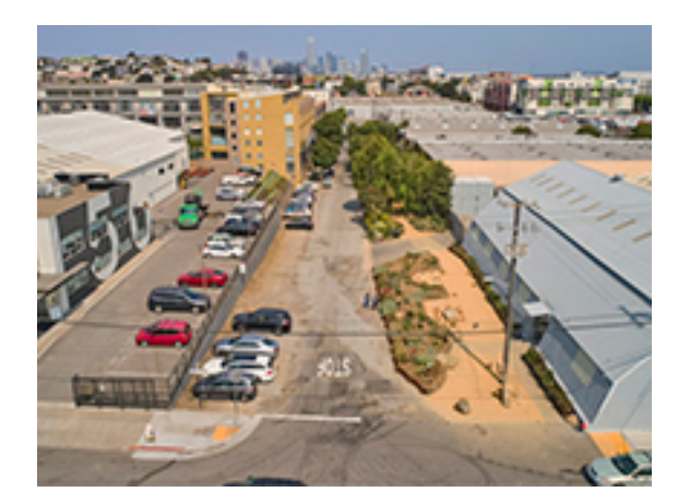
Minnesota Grove Extension, before and after

Dogpatch south of 23<sup>rd</sup> is a tumble of unaccepted streets lacking sidewalks, crosswalks, lighting and drainage. It also hosts the City's largest concentration of PDR (light manufacturing) businesses, several large residential complexes and, more recently, world-famous galleries, artists' studios, trendy restaurants and breweries. At the heart of all that is Minnesota Street and the Minnesota Grove – a block long urban forest. It has been a long time dream of neighbors and local businesses to complete the Grove all the way south to 25<sup>th</sup> Street. The recently completed extension: