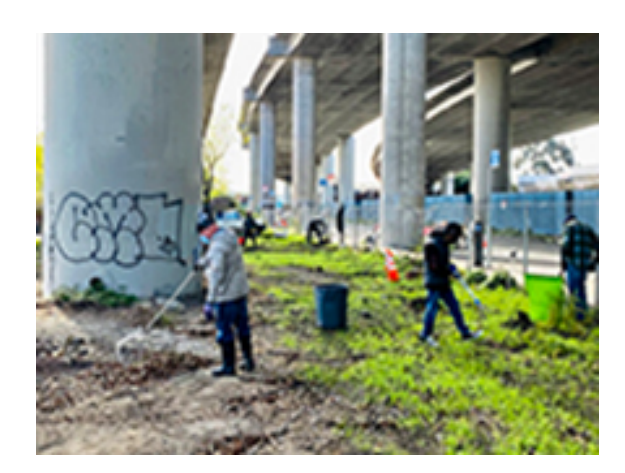
The freeway parcel known as the Gears

The Gears parcel is the last large, sunny Caltrans parcel in the district alongside the 280 freeway. Plans were underway to remove the existing mature ash trees and pave the lot for Food Bank parking. The GBD was able to find a better location for Food Bank parking and then lease the lot from Caltrans. In the short term, the GBD and neighborhood volunteers are cleaning the lot. The GBD is in the process of replacing the ragged fencing and improving management of the stormwater than flows from the freeway in to the lot. The GBD will use a small portion of the lot for maintenance storage as the scope of the GBD's maintenance work continues to increase annually. We are consulting with neighbors on possible short and long term uses for the lot.